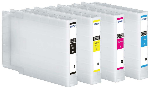
DURABrite® Pro T912 Genuine Epson® Ink initial cartridges

Printer designed for use exclusively with Epson Ink cartridges*.